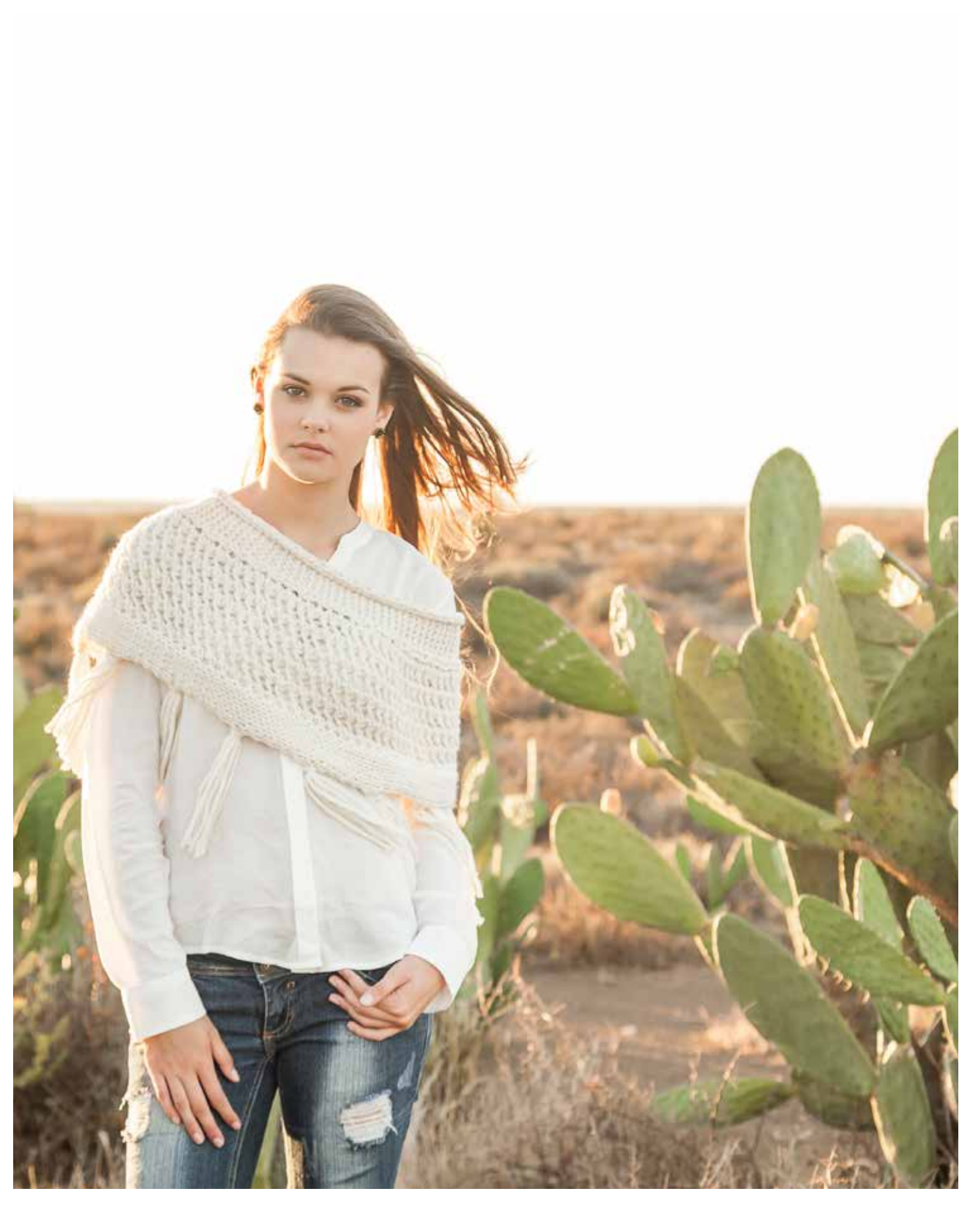
- WWW.AFRICANEXPRESSIONS.CO.ZA -