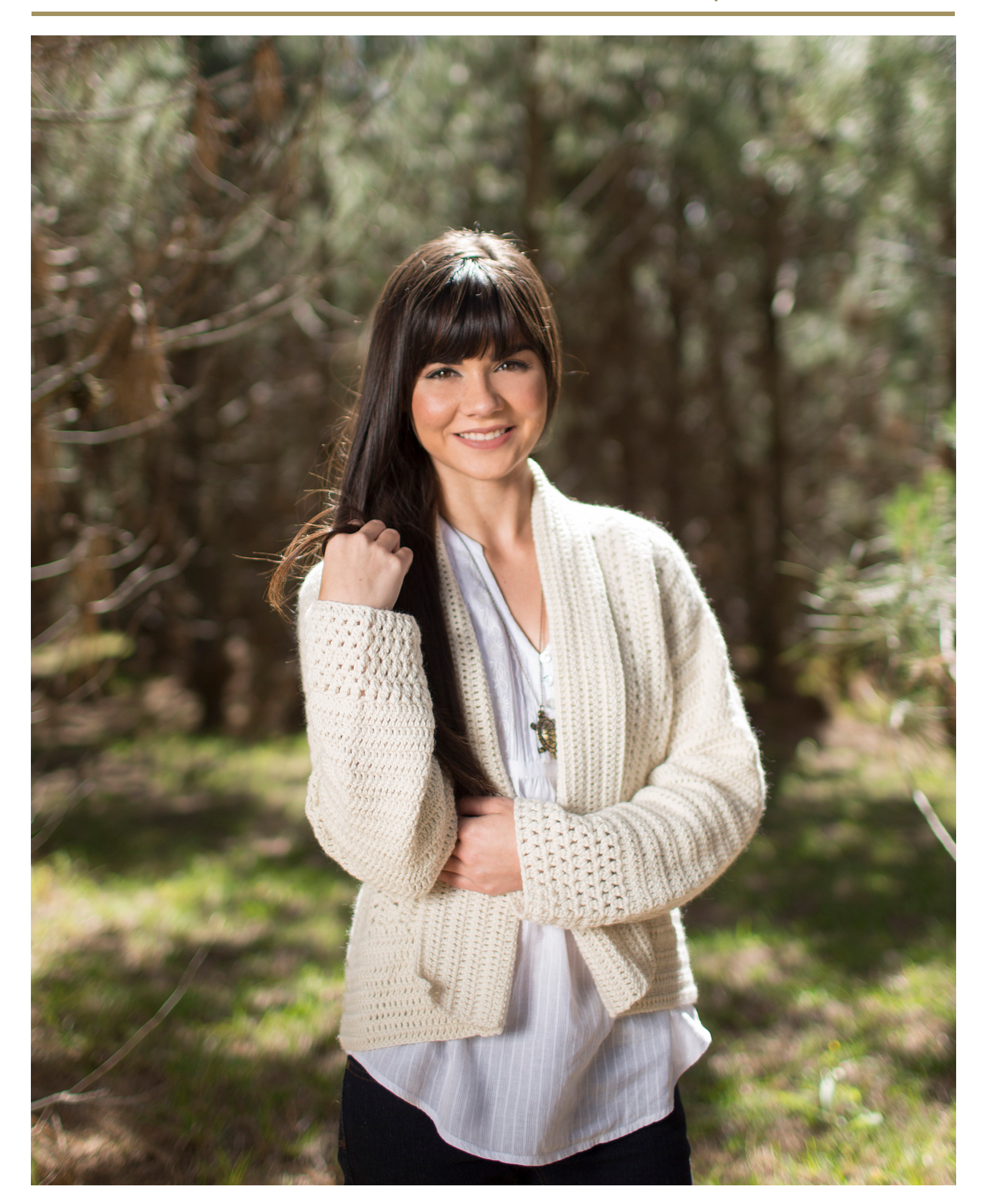
- WWW.AFRICANEXPRESSIONS.CO.ZA -