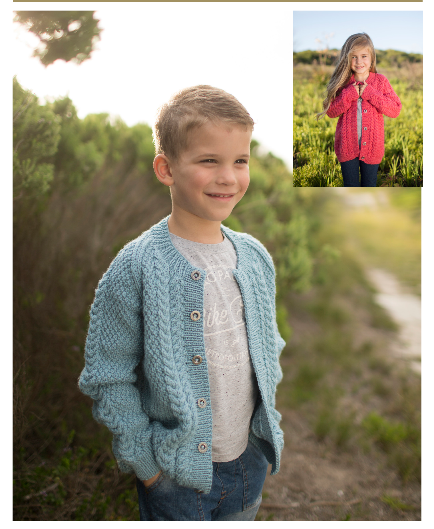
- WWW.AFRICANEXPRESSIONS.CO.ZA -