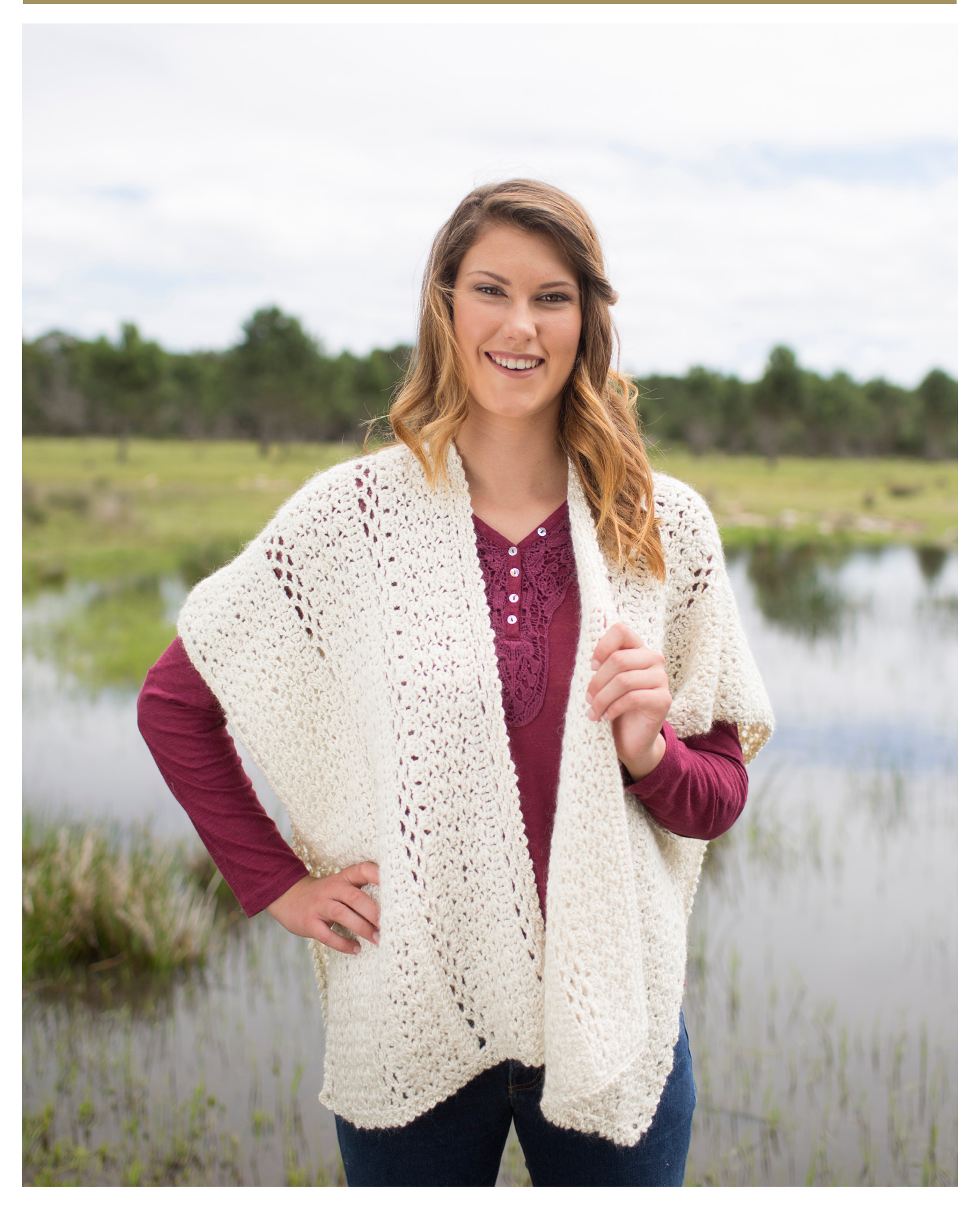
- WWW.AFRICANEXPRESSIONS.CO.ZA -