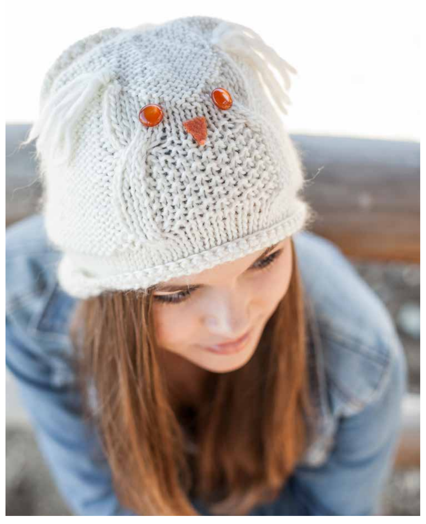
- WWW.AFRICANEXPRESSIONS.CO.ZA -